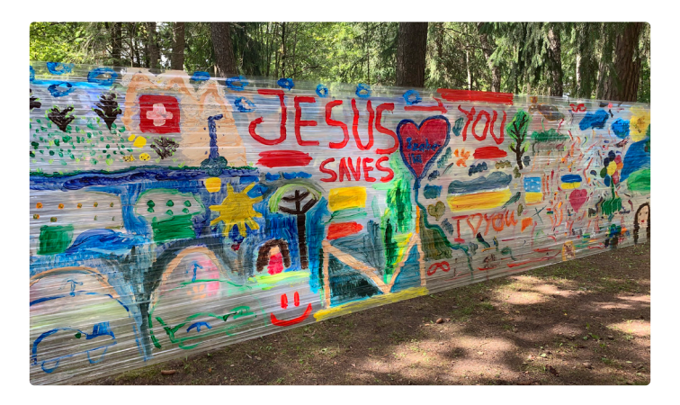
Kids at camp learned about the saving love of Jesus

Your ongoing partnership and prayers have allowed the good news seeds of the Gospel to be planted into the hearts of these children, who so desperately need hope at this time.